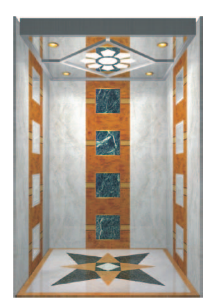
SJEQ 626 Ceiling: mirror ST/ST + acrylic lighting + down lighting Car wall: polychrome panel