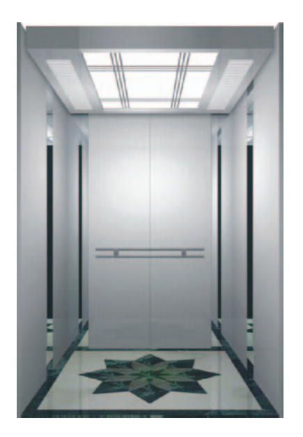
SJEQ J033 Ceiling: hairline ST/ST + acrylic lighting. Car wall: mirror ST/ST + hairline ST/ST Handrail: double ST/ST