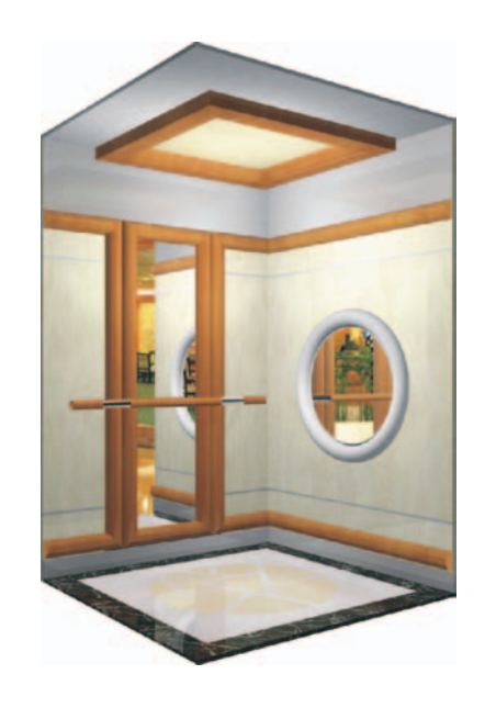
SJEQ N03B Ceiling: wood of teak + leather of goat. Car wall: knurl wood + wood of teak + hairline ST/ST + mirror. Handrail: wood of teak + ST/ST