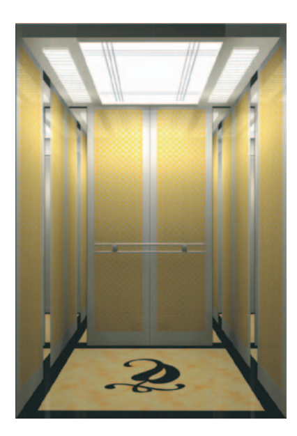
SJEQ 632 Ceiling: pained ST/ST + acrylic lighting decoration Car wall: mirror ST/ST+ polychrome panel Handrail: ST/ST double rail