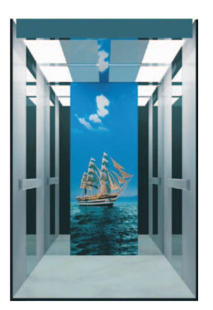
SJEQ ZY15 Ceiling: mirror ST/ST + acrylic Car wall: polychrome steel + hairline ST/ST + mirror ST/ST Handrail: stainless steel + al.