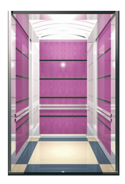
Ceiling: mirror ST/ST + glass + transparency, Car wall: painted ST/ST+ painted glass Handrail: mirror flat rail. Floor: artistic marble