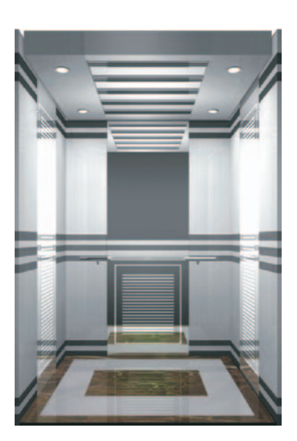
SJEQ J038 Ceiling: hairline ST/ST + mirror ST/ST + acrylic lighting + down lighting. Car wall: etched ST/ST Handrail: mirror ST/ST + transparent acrylic