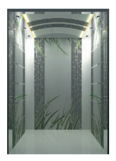
SJEQ 620 Ceiling: acrylic vault panel + hairline ST/ST Car wall: mirror ST/ST + hairline ST/ST + polychrome panel. Handrail: ST/ST+ Acrylic