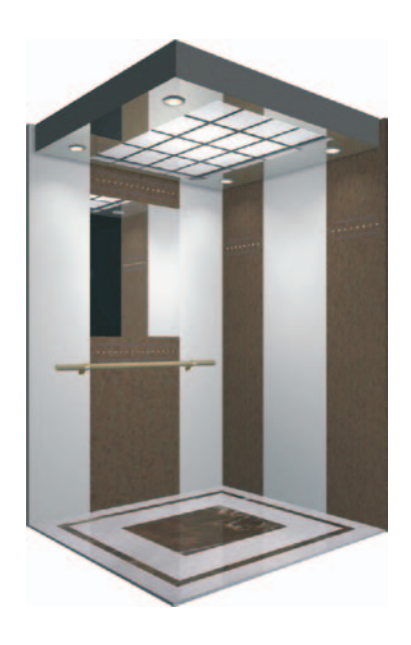
SJEQ J031 Ceiling : mirror ST/ST + acrylic lighting + down lighting Car wall: inlayed with mirror + steelC123 and C116 Handrail: ST/ST + wood.