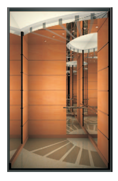
JC-206 Ceiling: mirror ST/ST + acrylic lighting + transparency, Car wall: mirror PVD coated ST/ST + wood Handrail: mirror single Floor: artistic ceramic