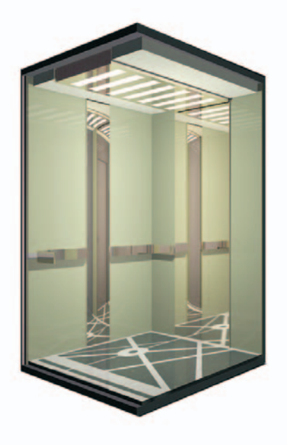
JC-211 Ceiling: mirror ST/ST +glass + transparency, Car wall: painted ST/ST+ painted glass Handrail: mirror flat rail. Floor: artistic marble