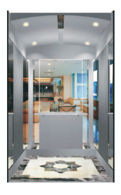
SJEQ N05 Ceiling: hairline vault ST/ST+ mirror ST/ST + down lighting Car wall: mirror ST/ST + hairline ST/ST+ mirror Handrail: ST/ST