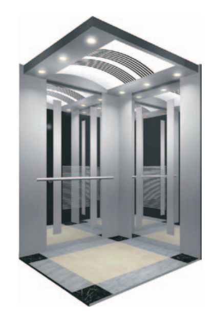
SJEQ N02 Ceiling: Hairline ST/ST +acrylic lighting + Vaulted Car wall: hairline & etched ST/ST Handrail: ST/ST