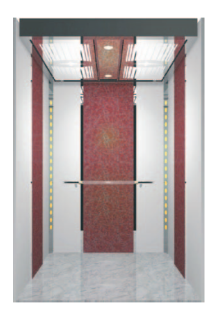
SJEQ J034 Ceiling: mirror ST/ST + acrylic lighting + down lighting. Car wall: steel C112 and C116 + mirror ST/ST Handrail: mirror ST/ST + acrylic.