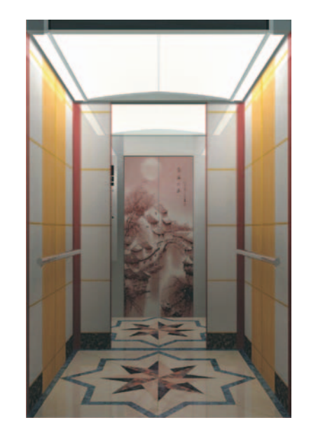
SJEQ 610 Ceiling: sprayed ST/ST + acrylic lighting Car wall: mirror ST/ST + polychrome panel Handrail: ST/ST