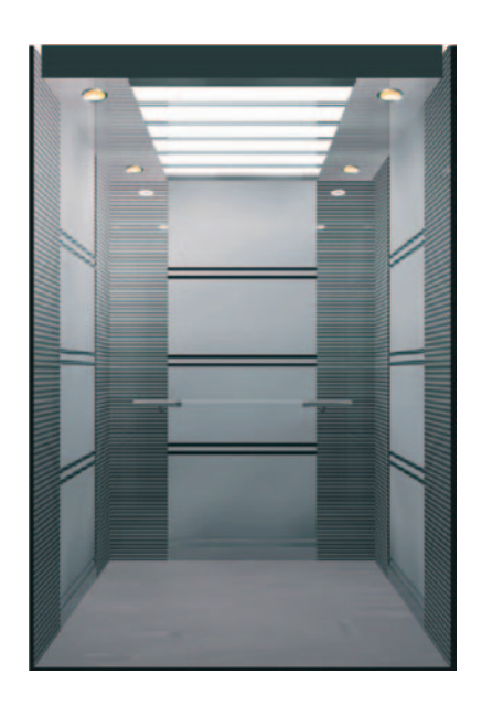
SJEQ N19 Ceiling: mirror ST/ST+ acrylic Car wall: etched ST/ST + leather line steel + Mirror ST/ST Handrail: transparent acrylic + mirror ST/ST