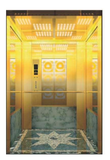
SJEQ 614 Ceiling: ti-plated ST/ST + acrylic lighting Car wall: glass + polychrome + ti-hairline ST/ST Handrail: ti-plated ST/ST

SJEQ J027 Ceiling: hairline ST/ST + mirror ST/ST + acrylic lighting decoration Car wall: mirror ST/ST + hairline ST/ST + inlaid with brass Handrail: ternate ST/ST