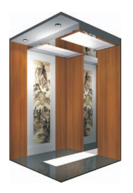
SJEQ ZY07 Ceiling: backed enamel steel + mirror ST/ST Car wall: polychrome steel + mirror ST/ST