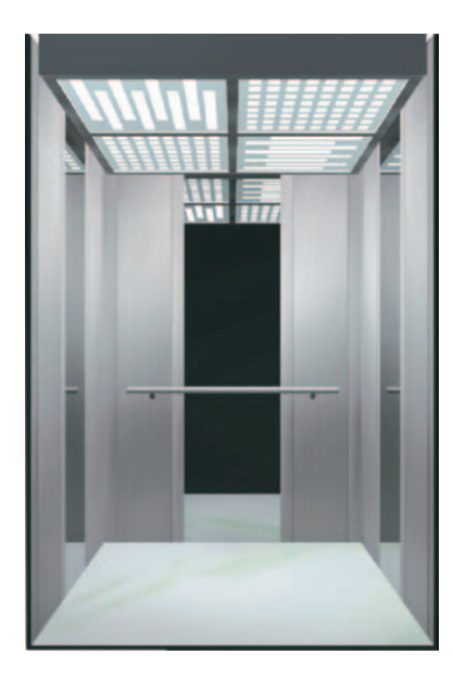
SJEQ N16 Ceiling: hairline ST/ST + Mirror ST/ST + acrylic decoration Car wall: mirror ST/ST + hairline ST/ST Handrail: stainless steel