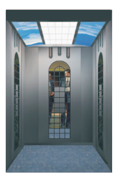
SJEQ N17 Ceiling: hairline ST/ST +acrylic Car wall: etched steel + hairline ST/ST

Ceiling: baked enamel steel + acrylic decoration Car wall: ti-plated hairline + ti-plated etched ST/ST Handrail: acrylic + ti-plated ST/ST, \Phi 42mm.