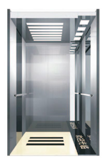
SJEQ N13 Ceiling: mirror ST/ST + acrylic (lamp covers). Car wall: mirror st./st. + hairline ST/ST + etched ST/ST