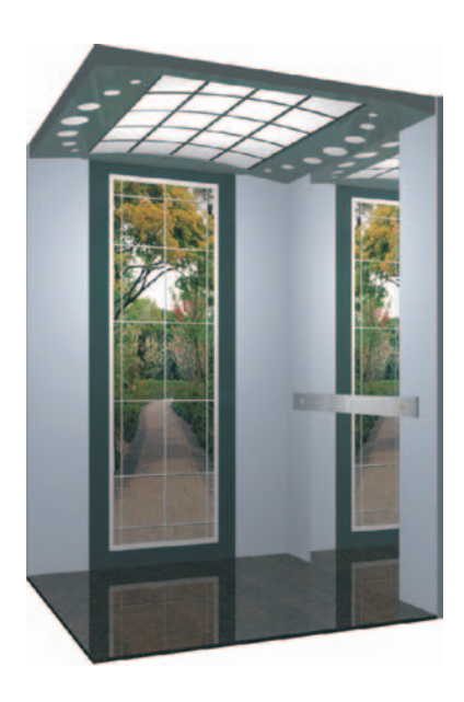
SJEQ Zy11 Ceiling: sprayed frame + acrylic lighting decoration Car wall: mirror ST/ST + polychrome ST/ST + sprayed steel. Handrail: ST/ST Flat .